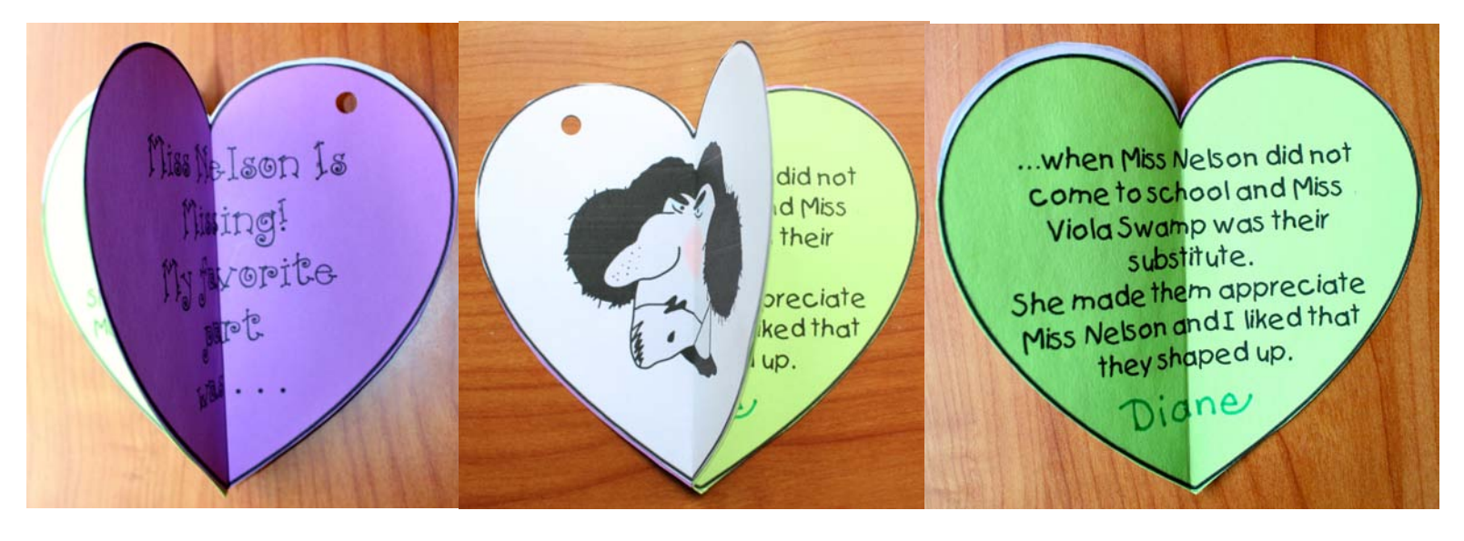
Print the "My Favorite part of the story" hearts off on a variety of colors of construction paper. Children choose 3, trim, fold them in half then glue them together to make a triple heart. Punch a hole in the corner. Attach a yarn loop & suspend from the ceiling.