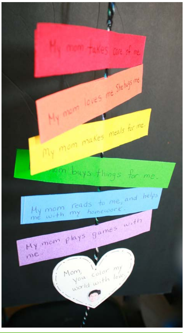
Mother's Day Rainbow Writing Prompt Craftivity