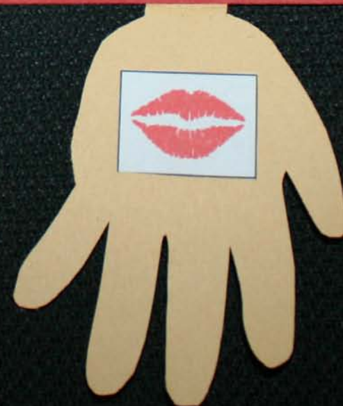
Flip hand down.

Wouldn't miss the chance to blow you a kiss! Keepsake Valentine