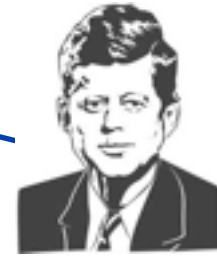
John F. Kennedy